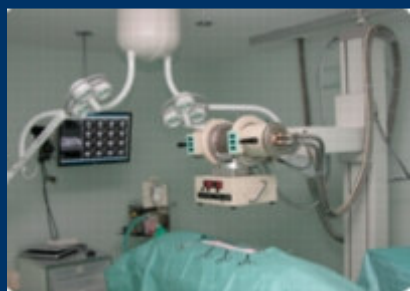
SARC's Radiotherapy suite

The scanner is housed in a fully lead-lined room, with patients